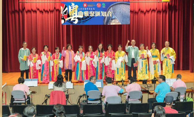
房協之友粵劇曲藝班學員(沙田/葵青/香港區) Chinese Opera Interest Classes (Shatin/Kwai Tsing/Hong Kong Island district)