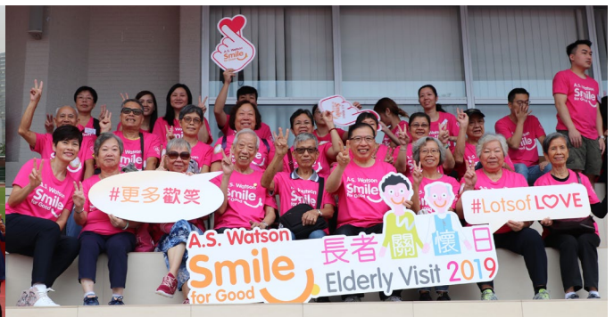
充滿善心的祖堯邨義工亦已蓄勢待發 Volunteers from Cho Yiu Chuen were also ready to show their love and care.