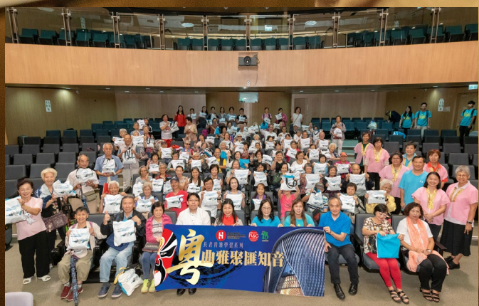
全體學員及導師團隊大合照 Group photos of Chinese Opera Interest Classes