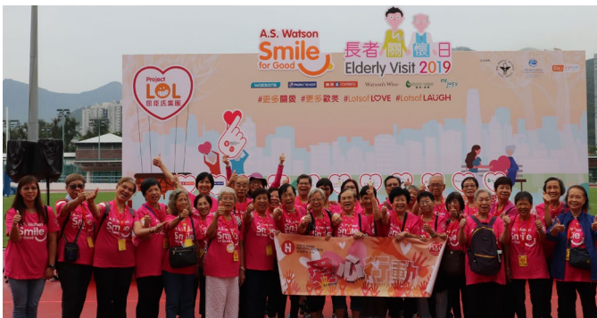
觀塘花園大廈一班義工們都笑容滿臉，準備將歡樂帶給長者 Volunteers from Kwun Tong Garden Estate were ready to share their happiness to elders