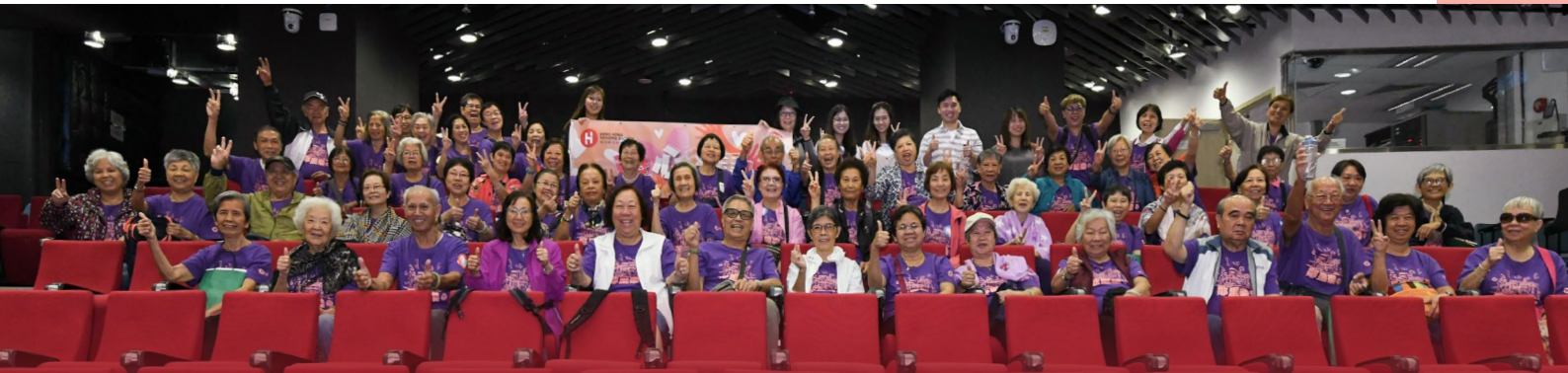
義工們準備投入參與為期9個月的訓練 Volunteers participated in the 9 months' training programme